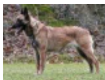
Kukay's Xantos litter day: 14.03.1998