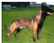
Hekse-Bepie van de Vroomshoeve litter day: 29.08.1999