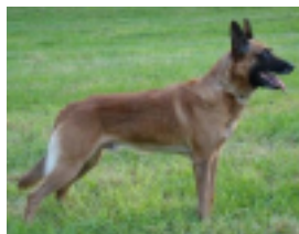
Tyra van de Vroomshoeve (Malinois)